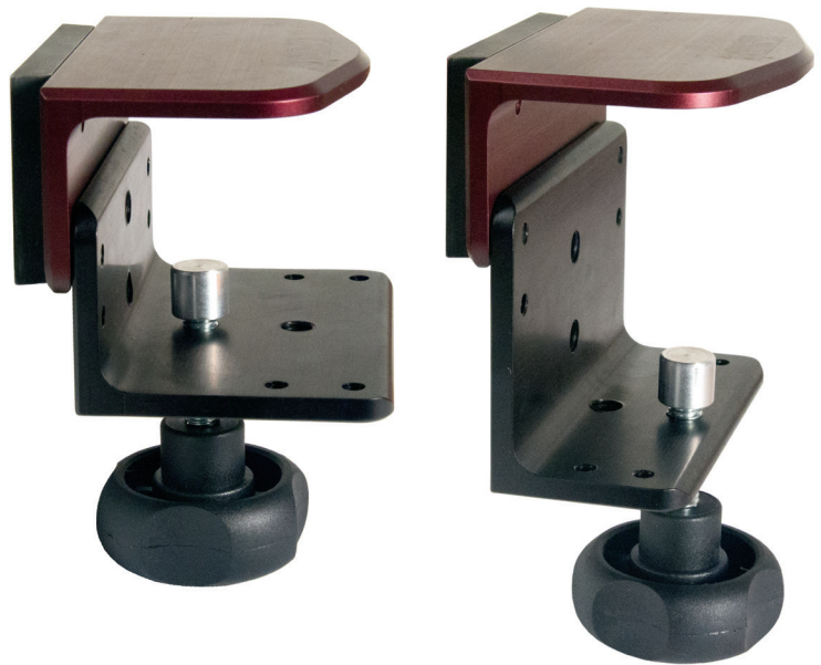
Various configurations of the clamp. Always try to make it as short as possible, and keep the screw to the rear, if you can.