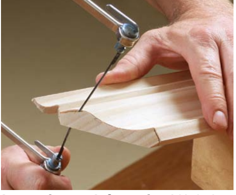
Low tension equals frustration. A blade that deflects in the cut makes it hard to pull back and forth and difficult to control. That means the saw might not cut where you want it to.

Taut blades deflect less. With the blade between a dial indicator and a screw head on the underside of a pivoting arm, Gochnour added weight to see how much each blade deflected.