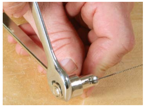
Inconvenient adjustment. To change angles on the Irwin saw, you must loosen and retighten the blade, which requires a wrench.