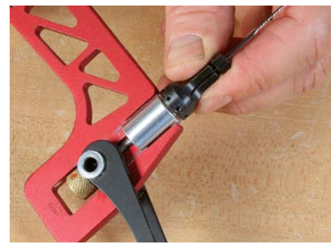
An improved twist on detents. Knew Concepts uses a rotating blade clamp with holes every 15° that fit over a pin to lock in blade angles.